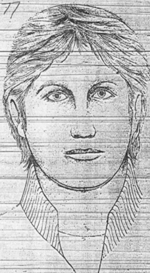
An artist's conception of the east-area rapist, based on numerous bits of information from persons who caught glimpses of him, was released today by the Sacramento County Sheriff's Department. No one has gotten a full-face view of the rapist, officers cautioned, noting that the shape of the jaw is tentative and the face may be leaner looking. Hair style and length also are tentative.